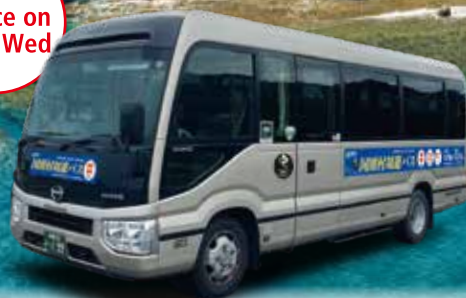
Kunigami Village Tour Bus Route Map